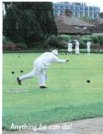
Anything he can do!