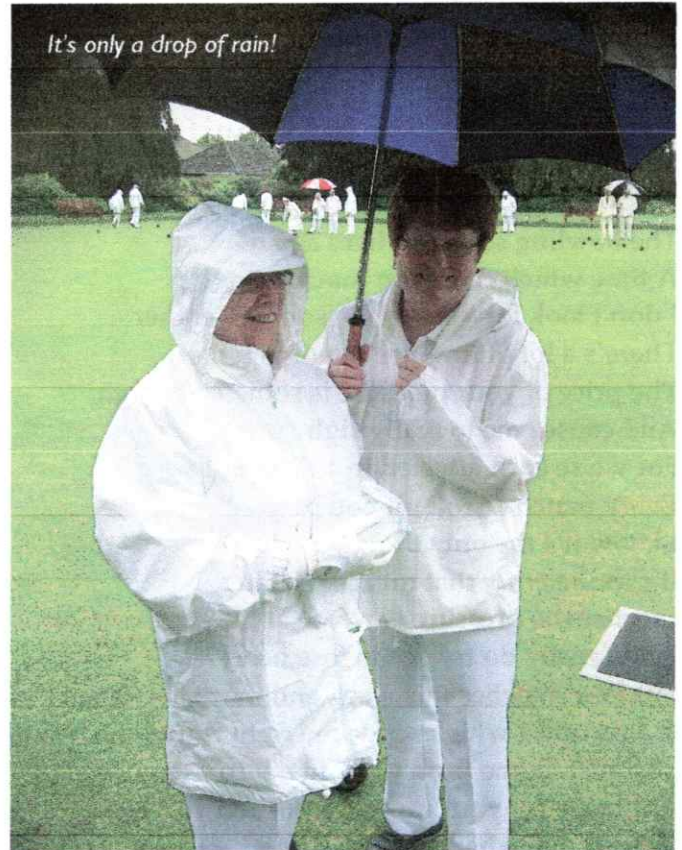
It's only a drop of rain!