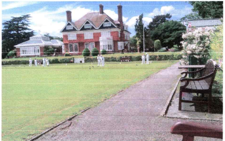
Met Police vs St Chads—Sat June 30th at Met Police Sports Centre, Chigwell