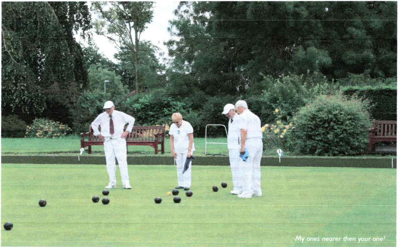
My ones nearer than your one!