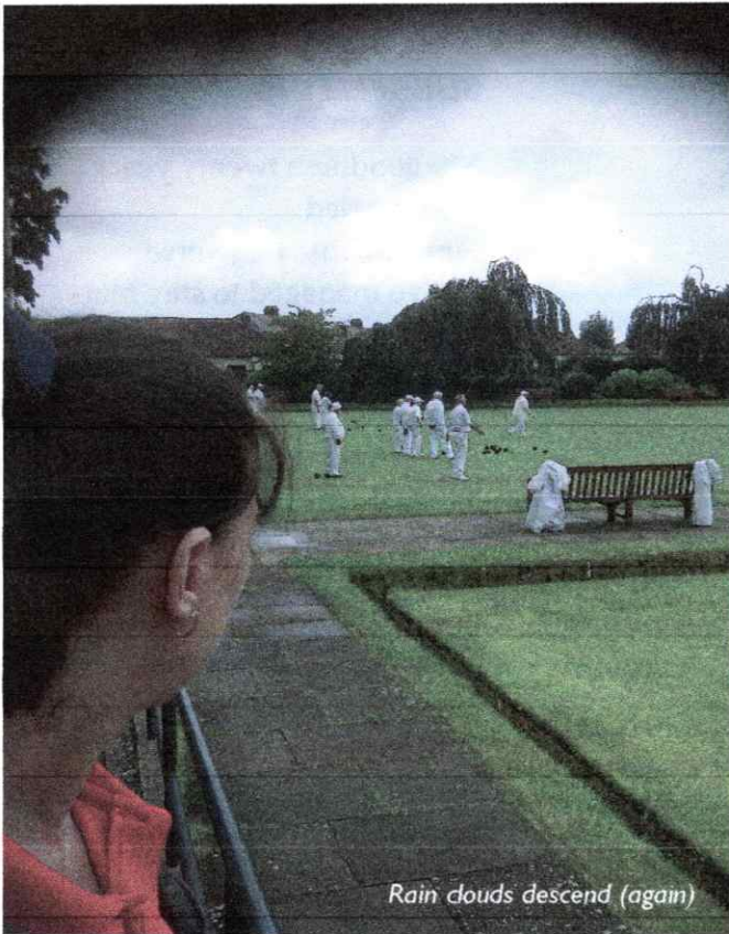
Rain clouds descend (again)