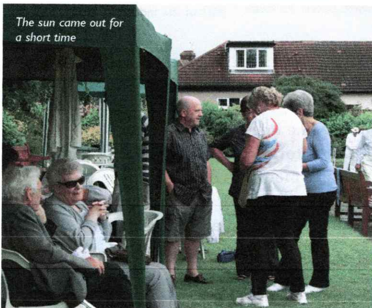
The sun came out for a short time