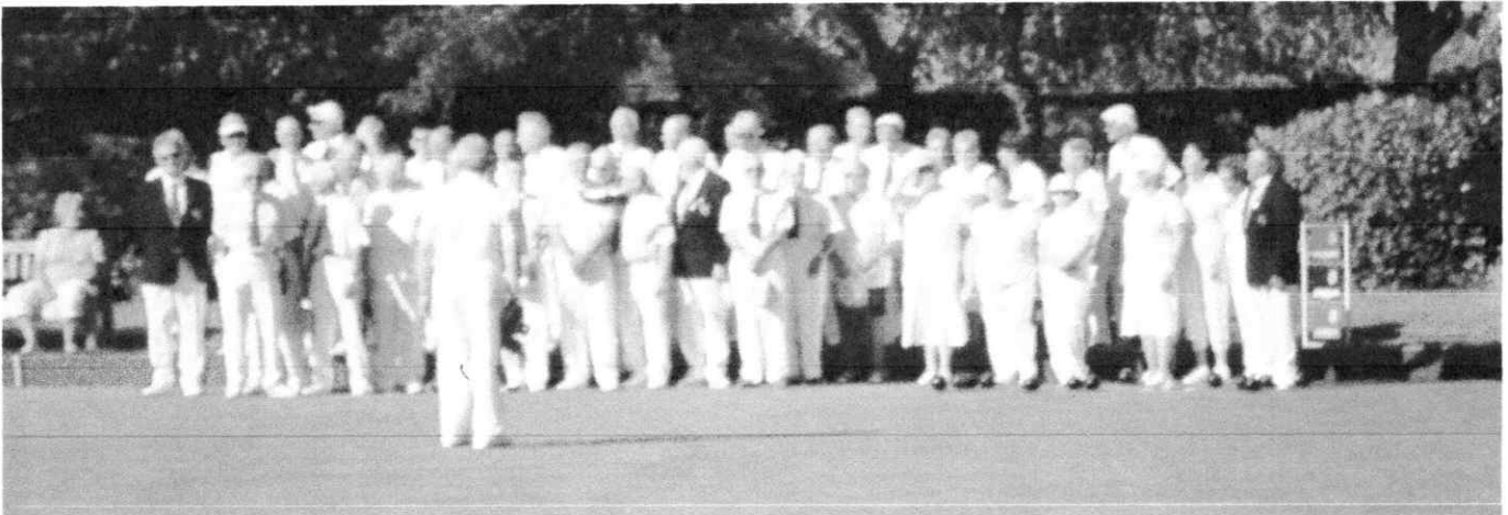
Which birdie were they looking at? Random group photo taken on October 2nd 2012